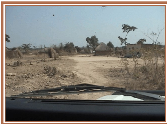
Entering the village.

distance of just over five miles to the village. As we drove into the village and turned toward the small mud-brick church building, we began to hear the faint sounds of joyous praises unto the Lord.