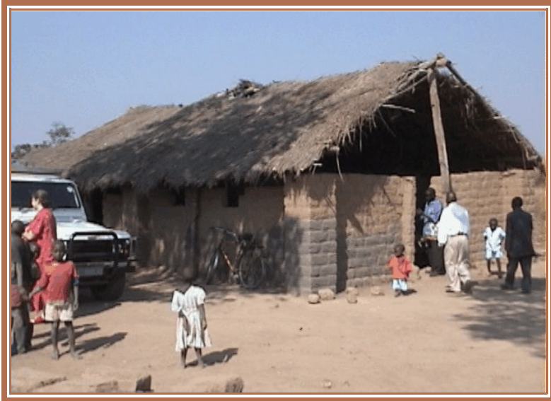
Just after we arrived at the village church.