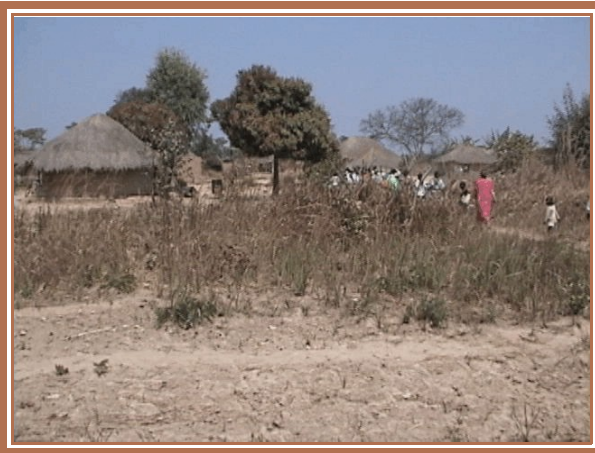
The baptismal party returns to the village.