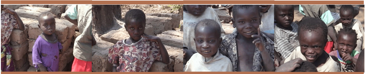
Pray for the people of the Democratic Republic of the Congo.

According to recent statistics, 48% of the population of the D. R. Congo is fourteen or under in age. We certainly noticed the large number of little children in this village, many of whom were dirty and seemed malnourished. We wish we could help each one of them find better health and a more prosperous life, but we don't have the financial resources to do that. So hopefully by establishing a strong witness of the apostolic message in their village, they can at least have hope for a wonderful and prosperous life in the world to come.