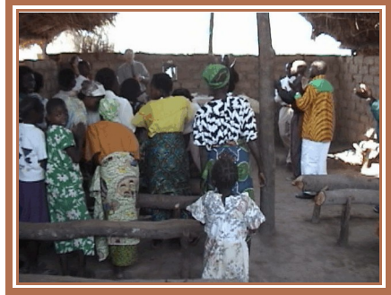
Ladies on the left, men on the right.