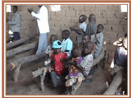
Children in the back.

After being greeted by the church leaders and many young children, we entered the thatch-roofed building where we joined in with joyous singing and worship.