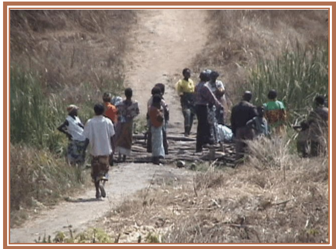
The baptismal site.

Once we arrived, six people were baptized in the name of Jesus Christ for the forgiveness of sins.