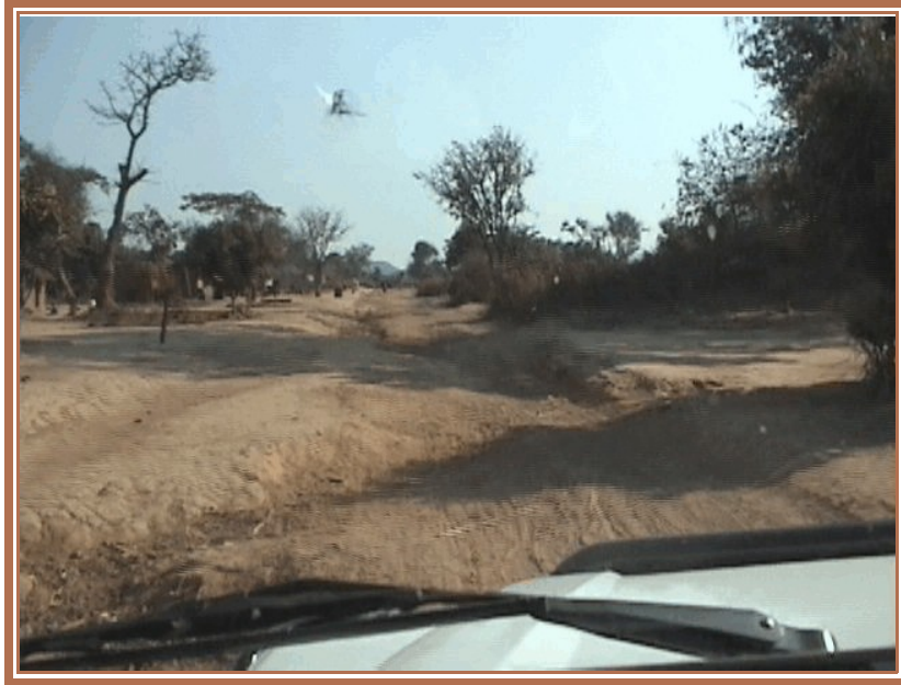
Dirt road to the Congolese village.

Sunday, August 11, 2003 Lubumbashi, Democratic Republic of the Congo